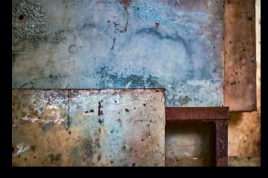
SURFACE OF THINGS