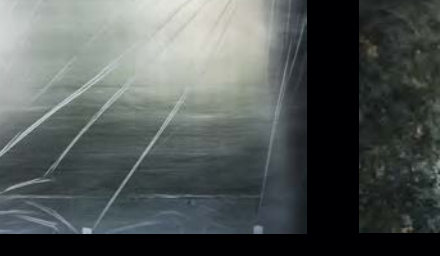
JAPANESE SLIP 2