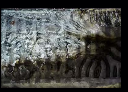
GATHERING OF WEARINESS