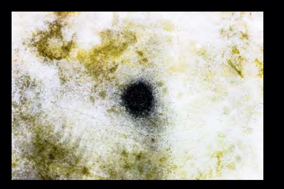
INSIDE THE HOLE