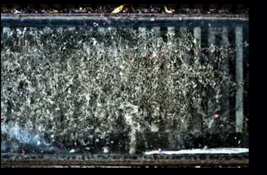
LOSE MY AIR