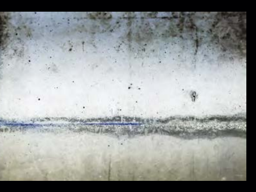
LA LIGNE BLEUE DES VOSGES